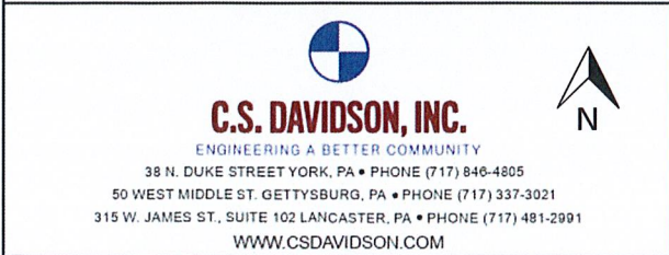
EXHIBIT C ORDINANCE NO. 373 PARCELS TO BE REZONED FROM LOW-DENSITY RESIDENTIAL TO AGRICULTURE CONEWAGO TOWNSHIP YORK COUNTY, PA